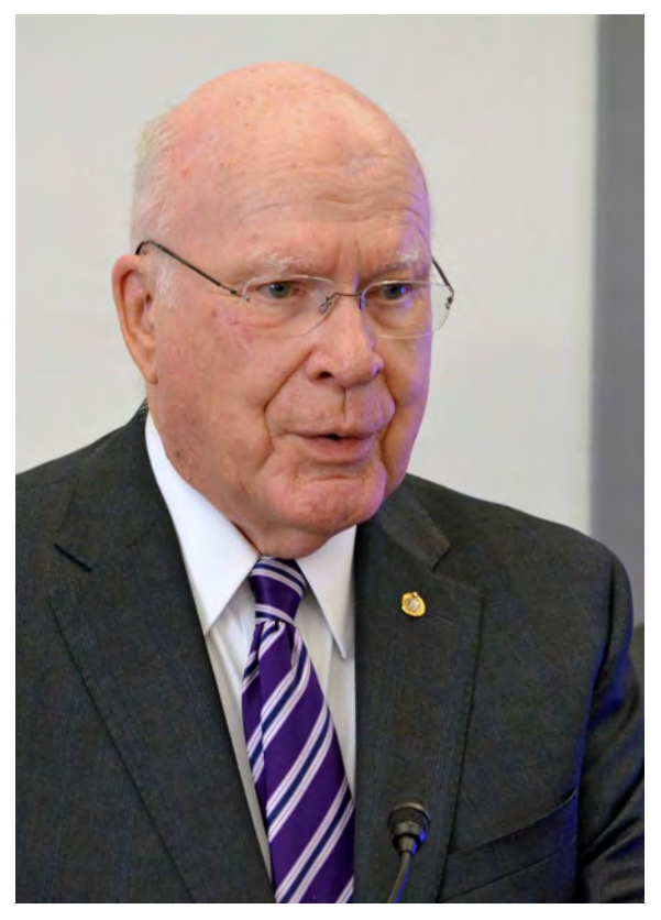
Senator Patrick Leahy (D-VT) gives remarks during the event "Al-Sisi in Washington: Egyptian President Seeks Support for Power Grab" on April 9, 2019.

These holds placed on U.S. military aid and conditioned on specific improvements have shown that using aid as leverage can work, particularly if Congress and the administration are in agreement. U.S. leverage does have its limits, however. Conditioning military aid would not be able to turn al-Sisi into a democrat, but it can have a significant impact on issues deemed important enough to put significant weight behind.