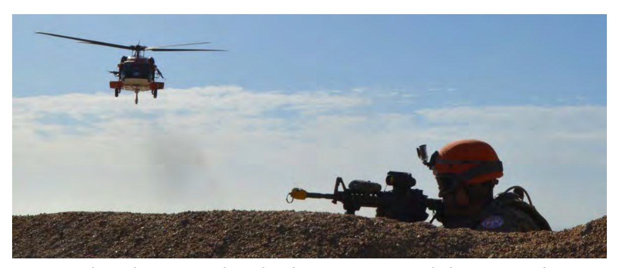
Troopers assigned to Apache Troop, 1st Squadron, 2nd Cavalry Regiment, participate in a land-to-air-to-sea casualty evacuation training exercise in the Sinai Peninsula, Egypt, January 22, 2016.

CAATSA sanctions as required by law.<sup>14</sup> In November 2019, it was reported that Secretary of Defense Mark Esper and Secretary Pompeo sent a letter to Egyptian Minister of Defense Mohamed Ahmed Zaki urging the Egyptians to cancel the Su-35 deal or risk sanctions.<sup>15</sup> If the Egyptian military completes the deal, CAATSA requires economic sanctions on the individuals and agencies within the military involved in the purchase. Along with possible restrictions within the U.S. banking system, the sanctions could threaten the $1.3 billion in military aid Egypt receives annually from the United States.