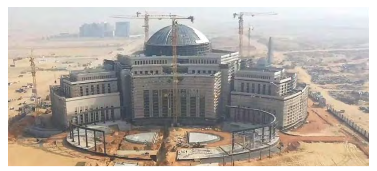
The military has taken a central role in multibillion dollar megaprojects such as the construction of Egypt's new administrative capital 30 miles east of Cairo.

42. The Officers' Republic: The Egyptian Military and Abuse of Power , Transparency International Defence & Security, March 2018, http://ti-defence.org/wp-content/uploads/2018/03/The_Officers_Republic_TIDS_March18.pdf