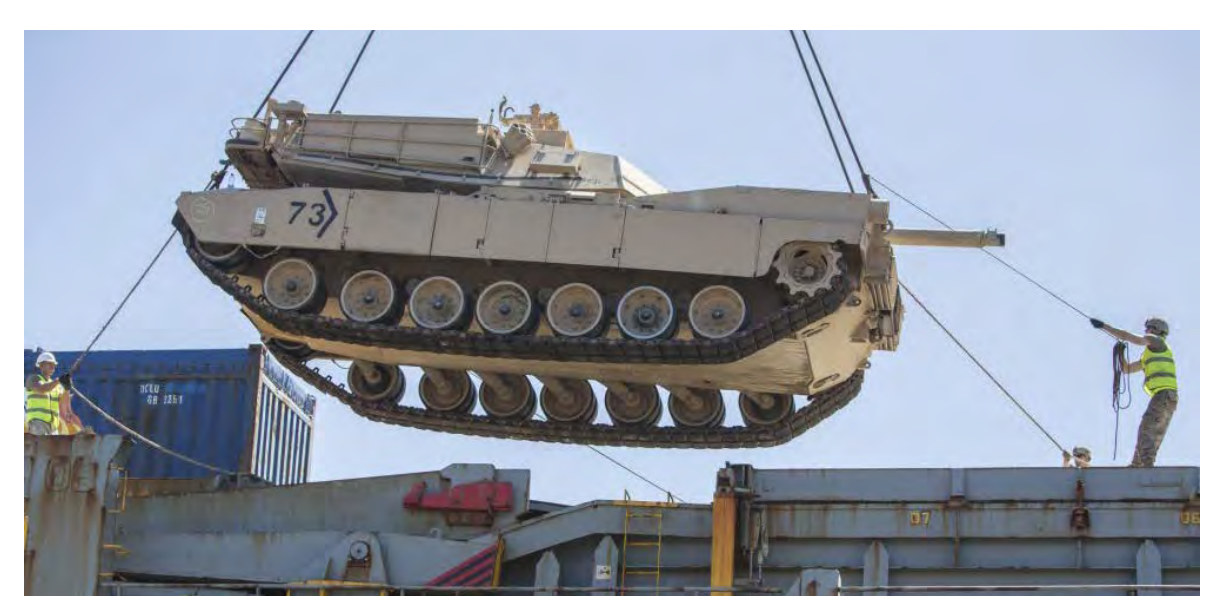
Soldiers stabilize an M1 Abrams battle tank during an equipment offload in Alexandria, Egypt, in preparation for Exercise Bright Star 2017.

9. All information on Egyptian military holdings in this section are from International Institute for Strategic Studies, The Military Balance 2019 (London: Routledge, 2019), pp. 336-340.