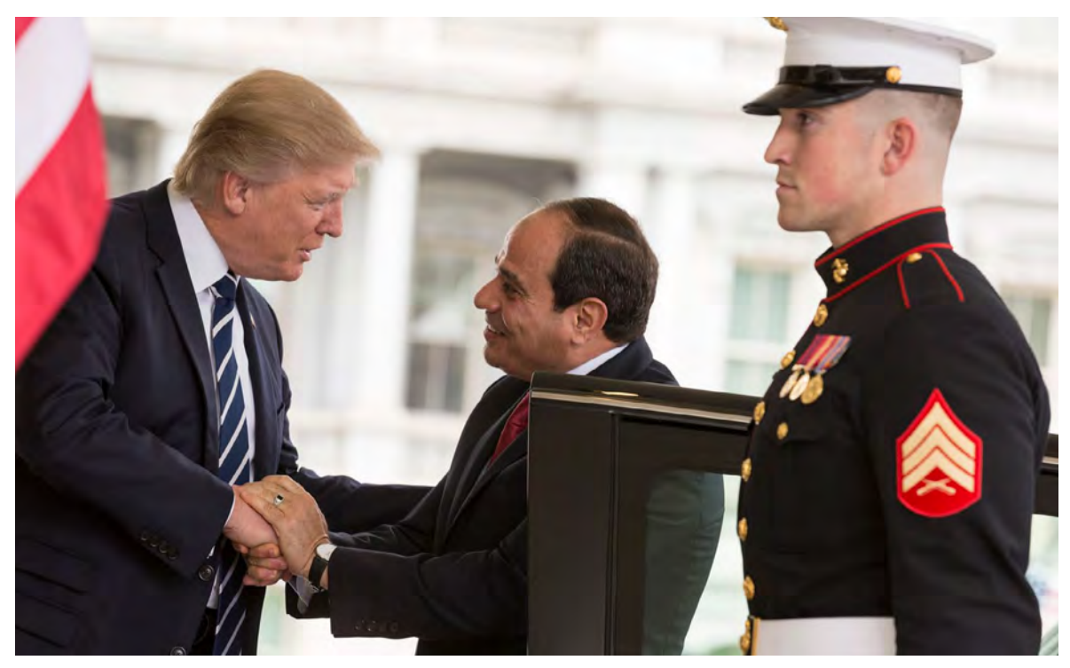
U.S. President Donald Trump welcomes Egyptian President Abdel Fattah al-Sisi to the White House, April 3, 2017.

know, in case there was any doubt, that we are very much behind President el-Sisi [sic]... He's done a fantastic job in a very difficult situation."<sup>7</sup> Then while waiting to meet with al-Sisi on the side of the 2019 Group of Seven Summit in France, Trump reportedly called out, "Where's my favorite dictator?"<sup>8</sup>