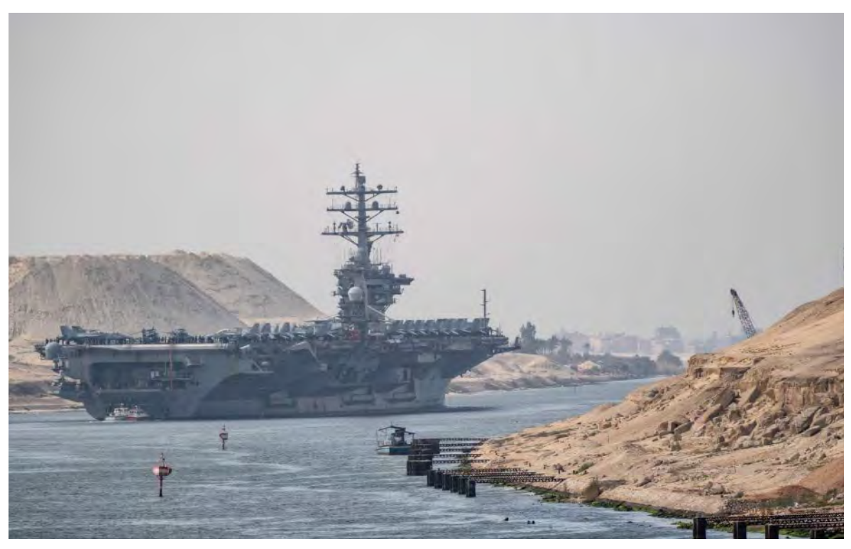
The aircraft carrier USS Dwight D. Eisenhower transits the Suez Canal on March 9, 2020. Egypt's control of the Suez Canal is one reason the country holds continued importance for the United States.

equipment to within the four pillars of fighting terrorism and bolstering border, maritime, and Sinai security. Recent FMS notifications indicate that the Egyptian government continues to prefer sustaining patronage networks rather than using U.S. largesse to enhance their capabilities to address the country's legitimate security threats.